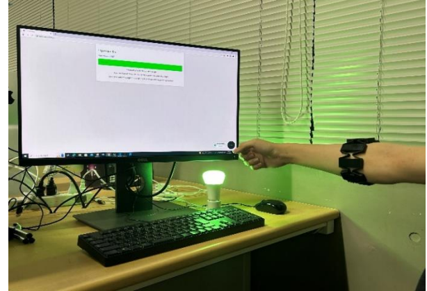
Fig. 2. The experiment scene